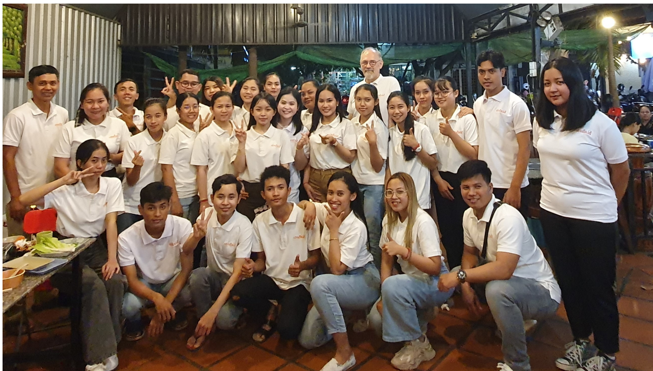
STUDAID students December 2022